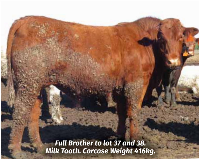
Full Brother to lot 37 and 38. Milk Tooth. Carcase Weight 416kg.

MONTPELLIER 04-11 (P) SEIFERT TEDSTAR (H) (Red) (Belmont Red) CORYMBIA 0089 (P)