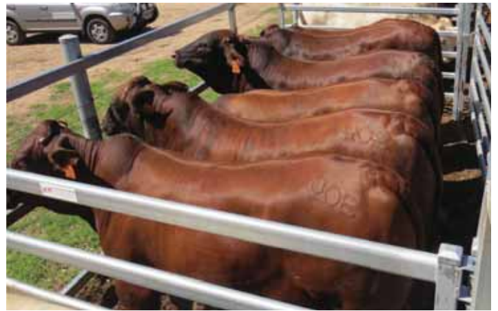
Marellan Shorthorns – Reserve Champion Export Pen of Steers – Brahman X Shorthorn.

FOR OVER HALF A CENTURY the Shorthorn Brahman combination has proven to be the most enduring and influential combination in the Northern Beef Industry. They are great paddock performers and great performers in the feedlot. Pictured here are some of our 25% Brahman, 75% Shorthorn Cattle that were on feed with Mort & Co for 100 days. The success of these cattle backs up our award winning feedlot steers from 2014.