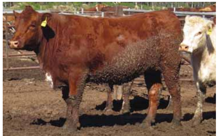
Sired by Marellan Light Year.