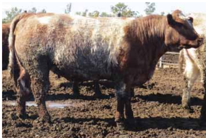
Marellan 3155 – sired by Marellan Nicodemus