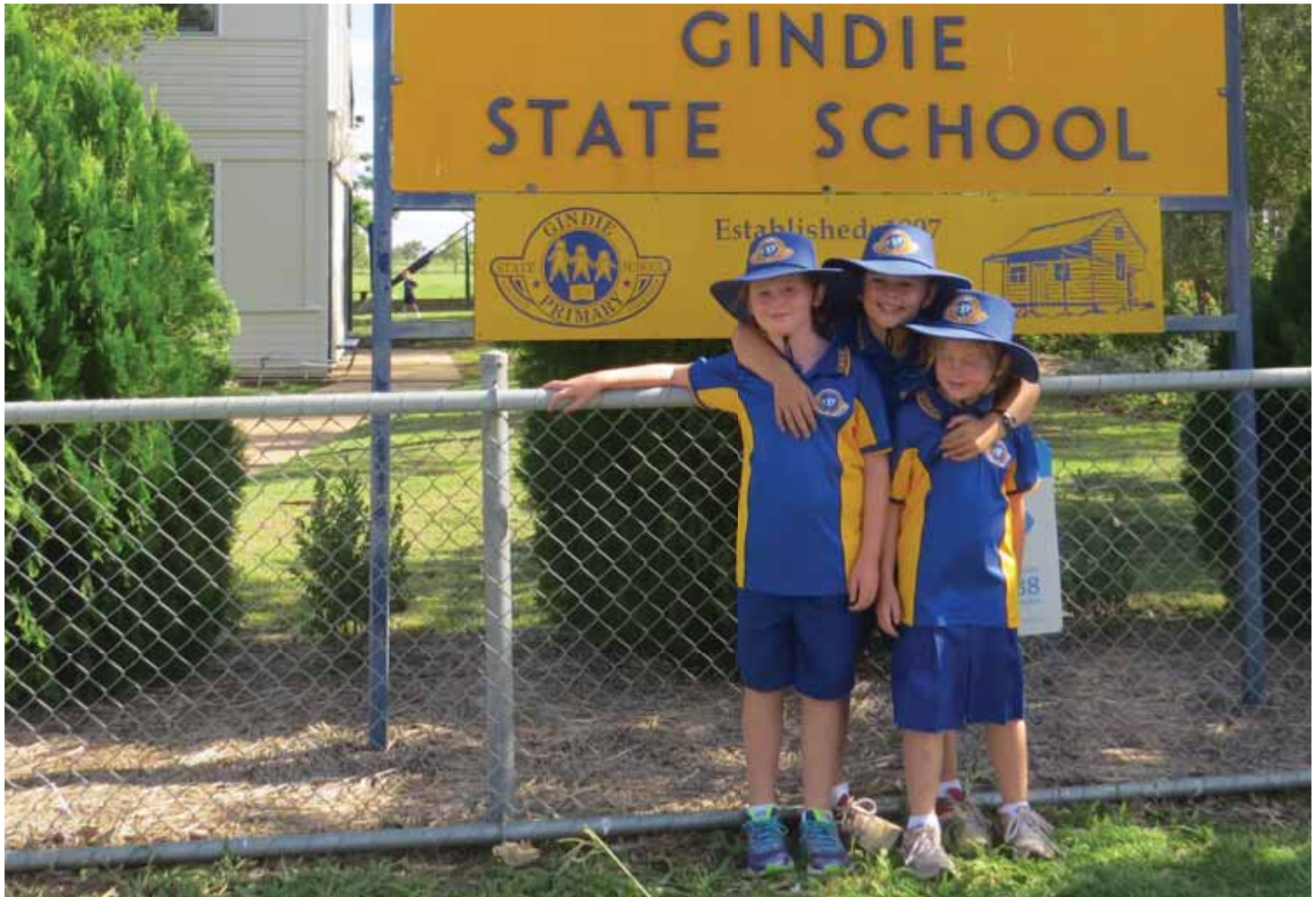
First Day of School - Gindie State School