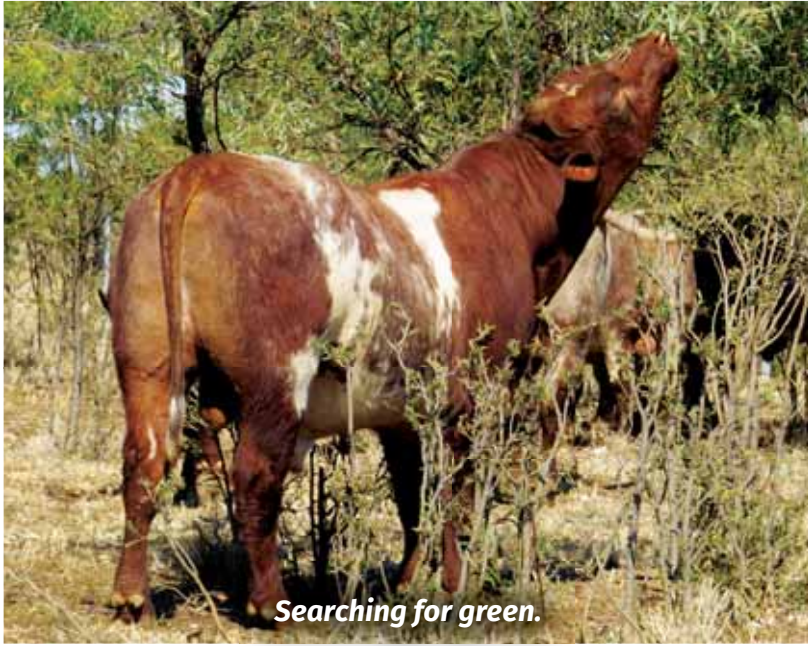
Searching for green.

SPRYS ADVANCER A114 (P) CRATHES FLYING SPUR F43 (P) (Roan) NEEARRA JUDITH 114 (P)