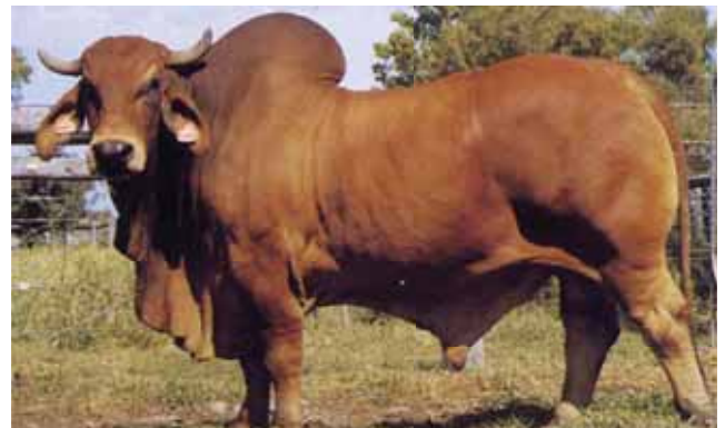
Tartrus Redmont (Brahman) - sire of lots 39 -41