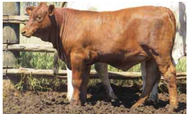
Marellan Shorthorn (Red Bull) X Grey Brahman Cow – Appleton Pastoral Co. Alpha