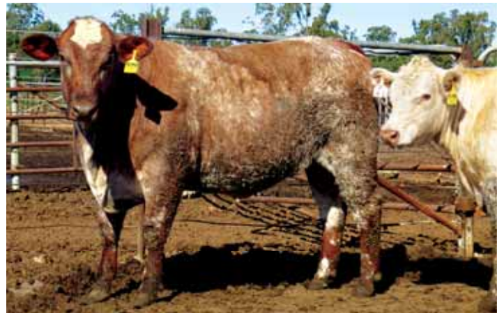
24 month Milk Tooth heifer.