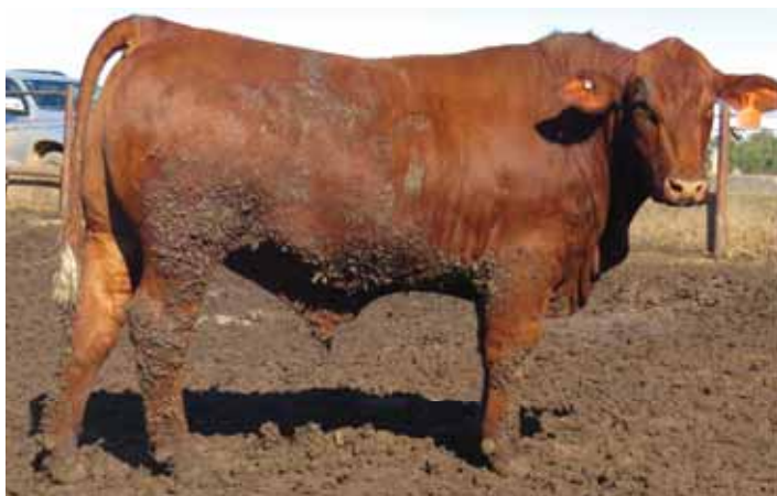
Marble 2.8 EMA 90cm 401kg dressed at 25mths.