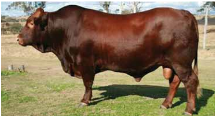
Seifert Tedstar (Belmont Red) - sire of lots 37 & 38

Use your QR reader App on your phone or visit www.marellan.com.au to find a link