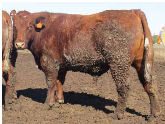
Marellan 3112. 25 months. 3.3kg gain. 505kg dressed. Sired by Crathes Flying Spur. Flying Spur is a Western Australian Bull we purchased because of his feet and carcass shape. He is the sire of lots; 3,4,5,8 & 32.