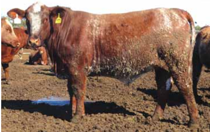
24 Months Sired by Crathes Flying Spur.