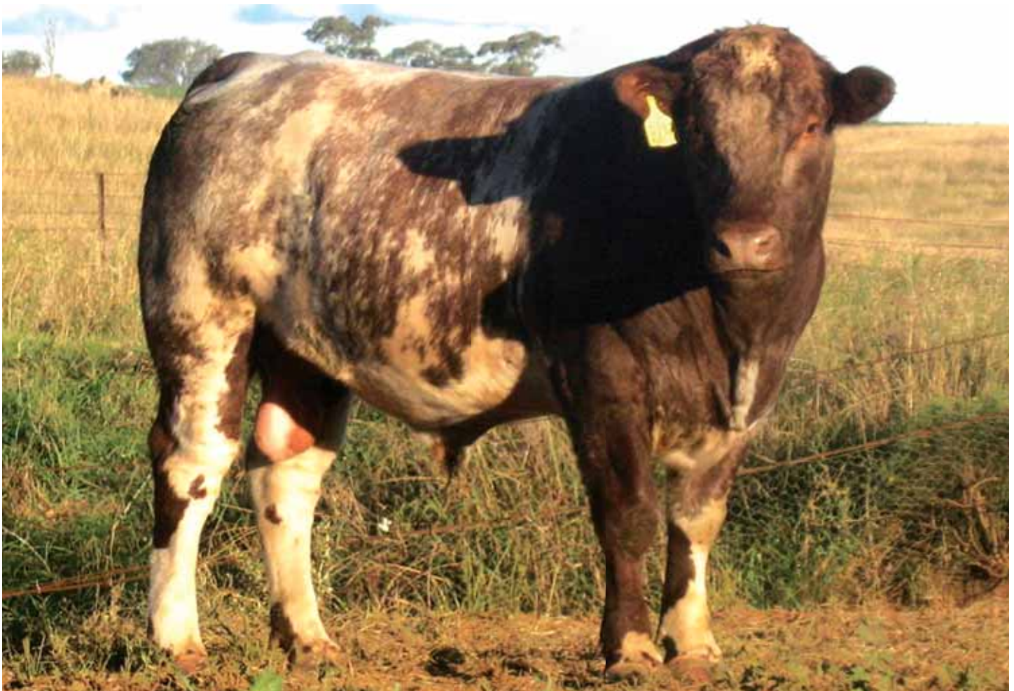
Marellan Nukarni (P) Pictured at 18 months. Sire of lots 2, 7, 9 & 28