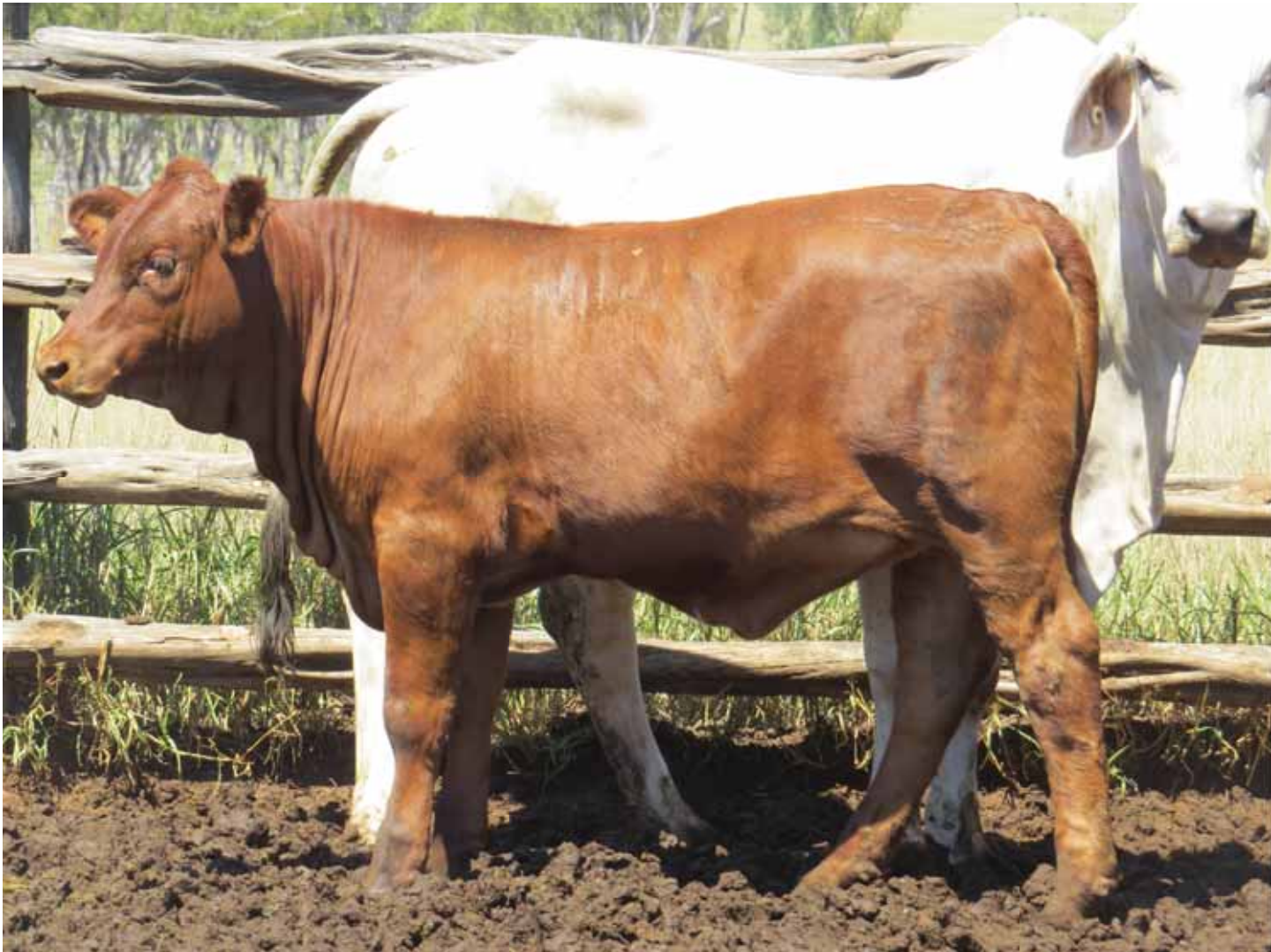
Organic Certified – Magnificent weaner heifer; High Quality Brahman Cow X Marellan Shorthorn Bull, Appleton Past. Co. Star Downs, Alpha.