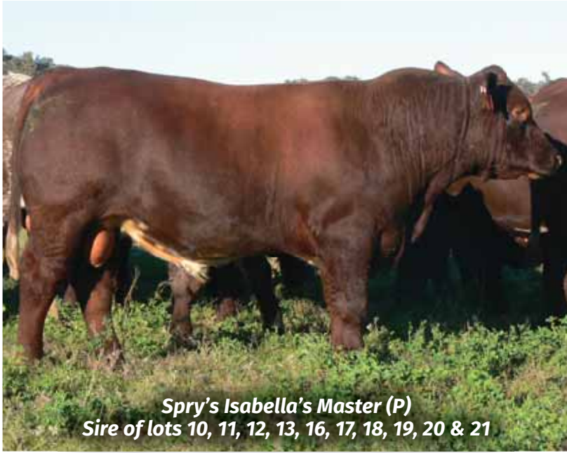
Spry's Isabella's Master (P) Sire of lots 10, 11, 12, 13, 16, 17, 18, 19, 20 & 21

LACHLAN MASTER CARD (P) (ET) SPRYS ISABELLA'S MASTER F293 (P) (Roan) SCHULLER ISABELLA C43 (P)