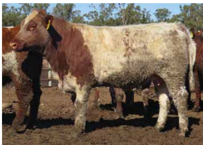
Marellan 3069 – sired by Marellan Nukarni