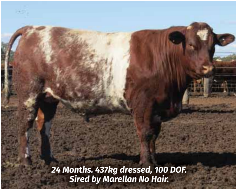
24 Months. 437kg dressed, 100 DOF. Sired by Marellan No Hair.

MARELLAN INDESTRUCTIBLE (P) MARELLAN NO HAIR (P) (Roan) ROYALLA FULLGLOSS 7261K (P) BARANA DIMENSION (P) MARELLAN MURIEL 1305 (P) (Red) MARELLAN MURIEL J6250 (P)