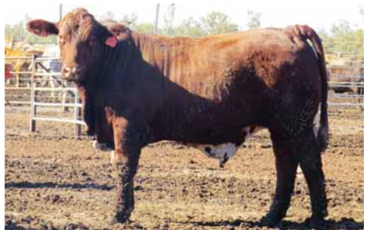
25mths. Grossed $2004.