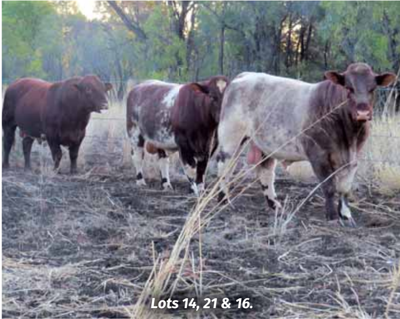
Lots 14, 21 & 16.