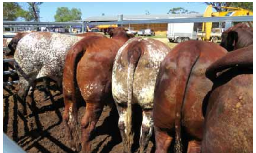
Brahman X Shorthorn Steers out of red, roan and white cows.