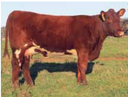
Marellan Isobel 2018 (P)

Pictured above is Marellan Isobel 7152 (P). Our number #1 donor cow. She is the dam of Nicodemus, Isobel 2018, Prince Caspian, lots 13, 16, 17, 20 & 21 and many others. In many respects she is our model cow bred for the commercial beef industry; fertile, feminine and has both carcass and coverage. The Marellan Isobel cow family has world renowned, having members in NZ, USA & Canada and soon the UK. We have been very pleased how her progeny and many of her descendants have handled the ticks. Her influence will be felt in our herd and in our clients' herds for many years to come. Please note, the high tail setting in the photo was a result of Embryo Transplant.