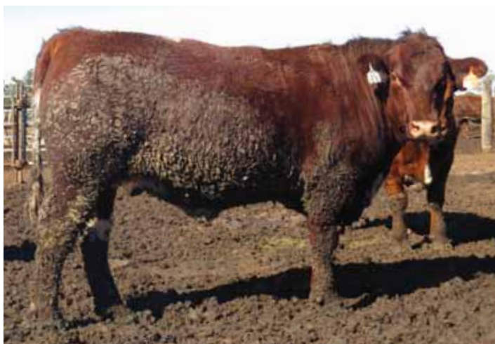
Marellan 3058. 25 months. 447kg dressed. Sired by Marellan On Target.