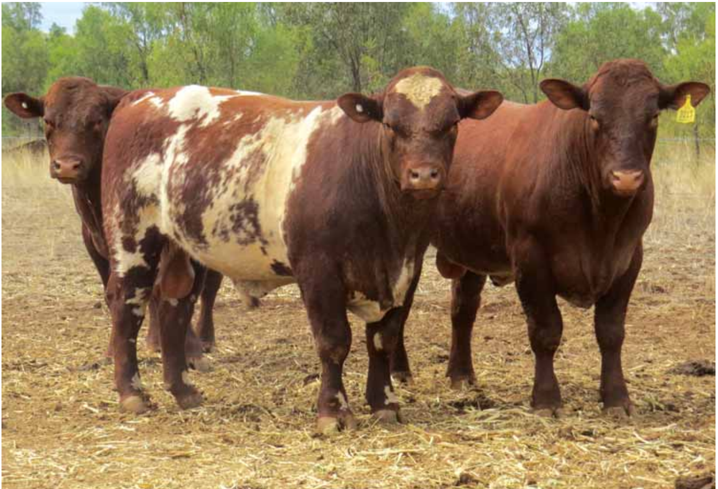
Lots (18), 15 & 17.