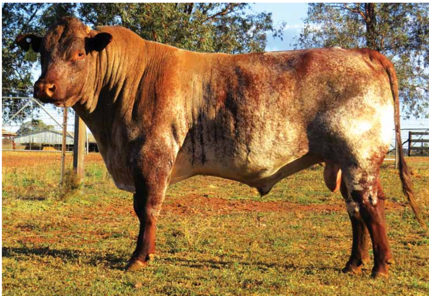
Marellan No Hair (P) Pictured at 3 years. Sire of lots 1 & 14.