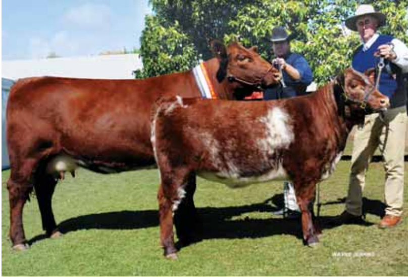
Royalla Margies Memory 9054 - Dam of lots 10, 11,12,18.

WEEBOLLABOLLA BOSWORTH B90 (P) MARELLAN NICODEMUS (P) (AI) (Roan) MARELLAN ISOBEL 7152 (P)