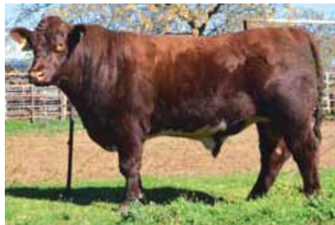
Marellan Prince Caspian (P)