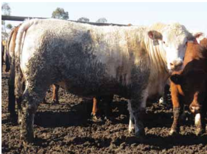
Marellan 3237. 23 months. 3.14kg gain and 421kg dressed. Sired by Marellan Nukarni